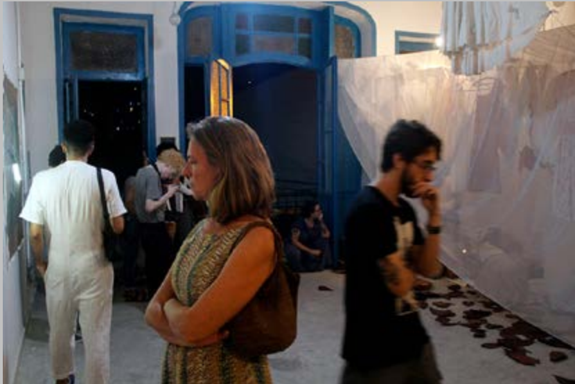
Open studio event at Despina (2018)